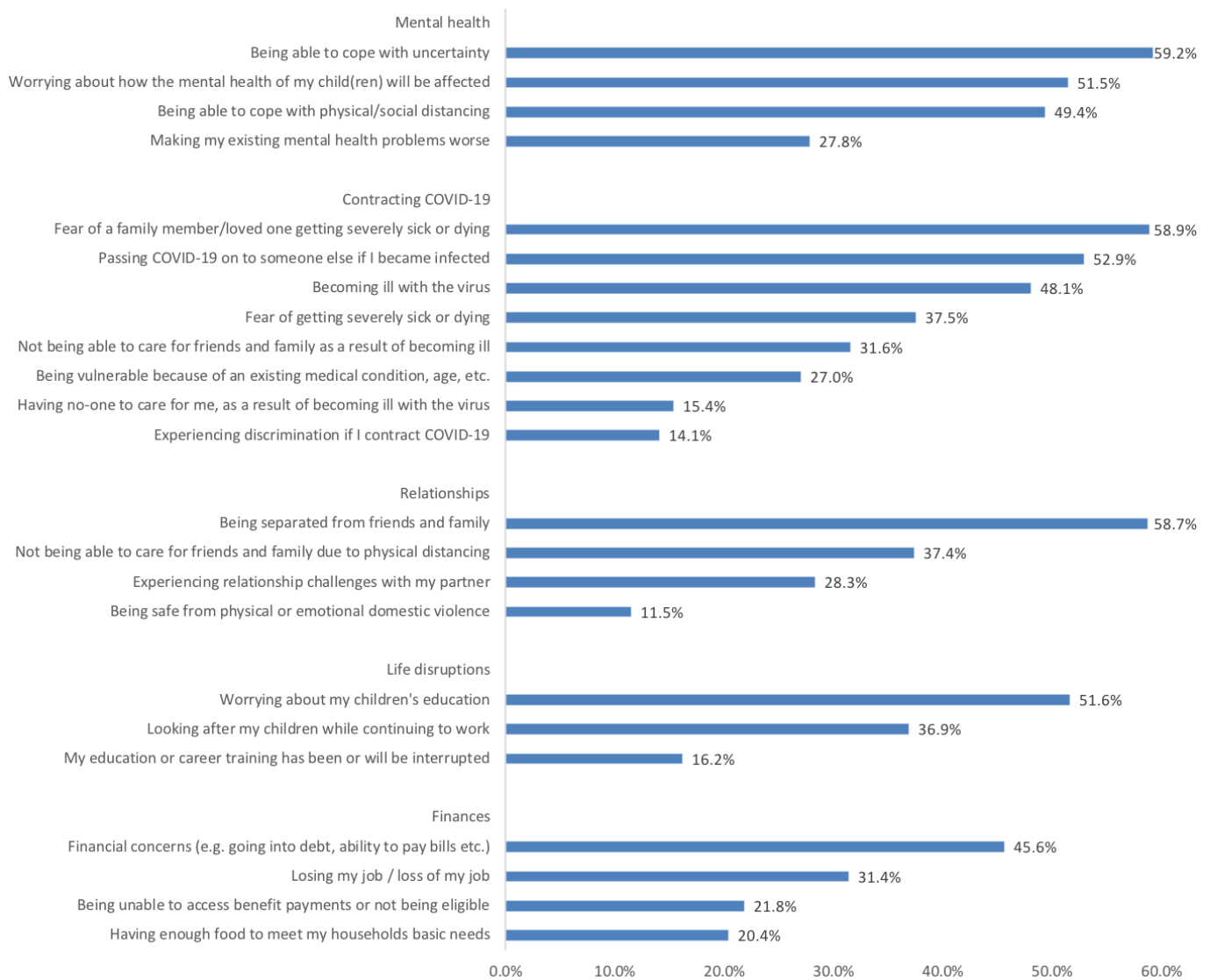
Figure 1 Parent stressors in the past 2 weeks as a result of the COVID-19 pandemic. Note: Maximum margin of error for proportions was \pm 3.9\% at a 95% level of confidence.

years living at home across a number of mental health constructs. Since the onset of the COVID-19 pandemic, a significantly higher proportion of parents reported deteriorated mental health (44.3%) compared with 35.6% among their counterparts without children <18 years at home, \chi^2(1, n=3000)=16.2, p<0.001 . Changes to mental health furthermore varied across sociodemographic characteristics within the parent subsample. Table 2 presents the proportions of parents reporting deteriorated mental health since the pandemic according to parent gender, age, pre-existing mental health conditions, disabilities, child age and employment and financial circumstances. Among parents with children at home, deteriorated mental health was significantly more prevalent among women, parents under age 35, parents with a pre-existing mental health condition, parents with a disability, parents of younger children ( \leq 4 years) and parents reporting financial stress. When asked about their emotions in