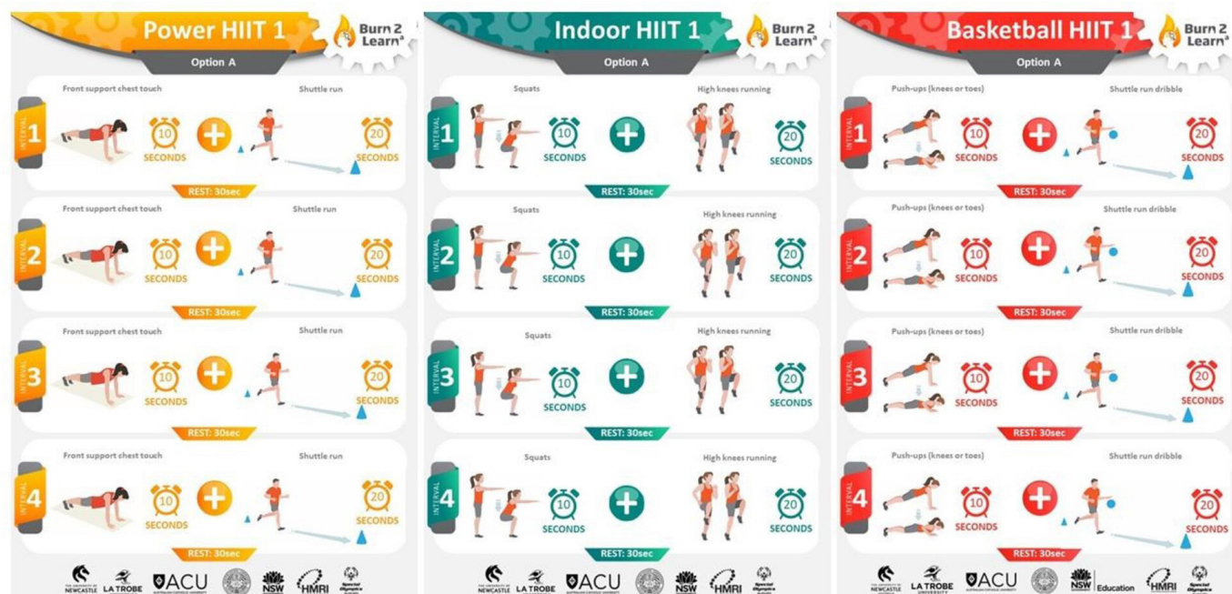
Figure 2 Examples of B2La HIIT session cards. This figure was created by the lead investigator.

17 onwards), students will be encouraged to engage in physical activity sessions of interest outside of school (eg, at home, the park), but teachers may continue to facilitate B2La sessions during lessons if they choose. Students will have their own B2La goal setting activity booklet.